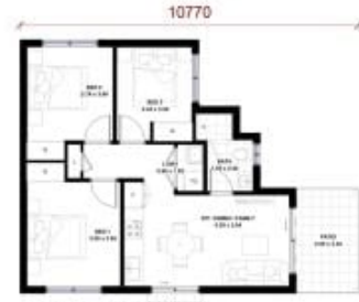
GRANNY FLOOR PLAN